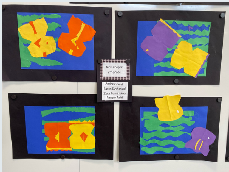
Meet the Masters