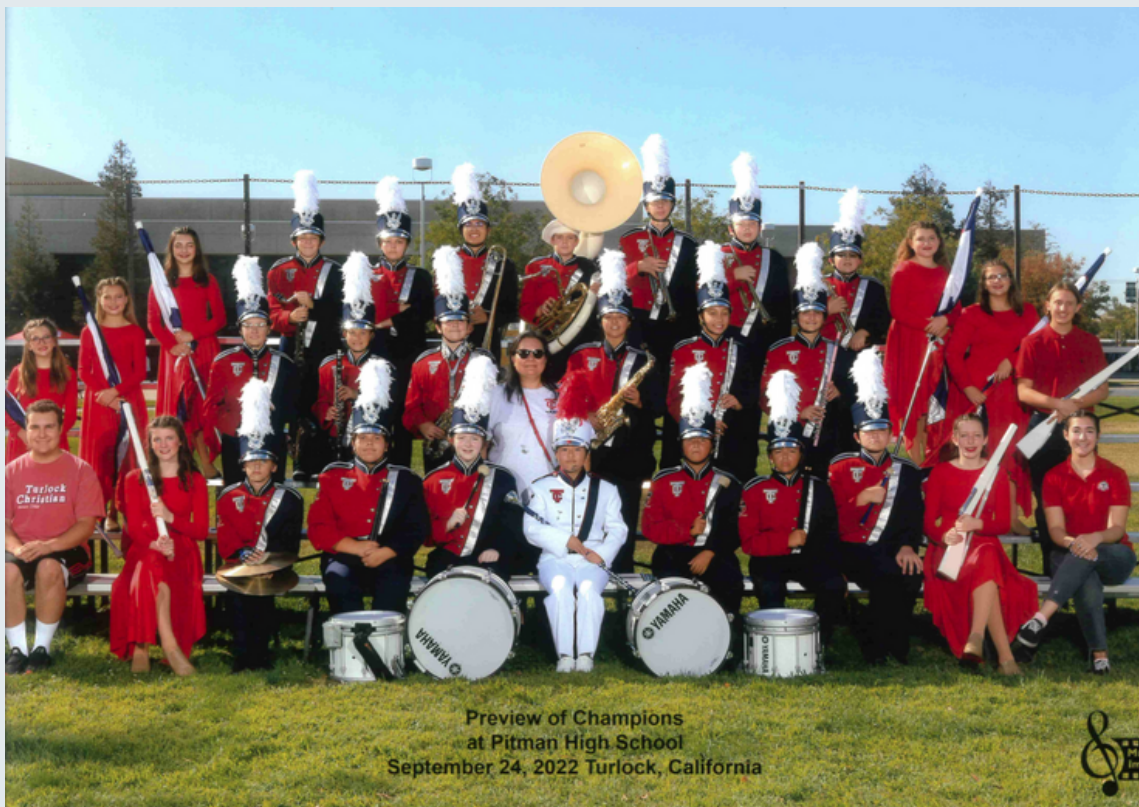
Preview of Champions at Pitman High School September 24, 2022 Turlock, California

Sacramento Leadership Experience is one in a lifetime experience you will never forget! Each year California FFA hosts its premier leadership development conference where seventy-five of our top graduating senior FFA members in the state are selected annually to step into the role of one of California's State Legislators. Students are assigned a specific California district and spend four days in Sacramento learning about government, issues in agriculture and ethics, water and natural resources, food and nutrition, and education. At the end of the week, students have the opportunity to conduct mock legislation they have drafted during the conference on the chamber floor of the state senate or assembly.